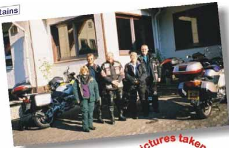
Outside the Hotel Harmonie in Bad Grund (where we stayed)