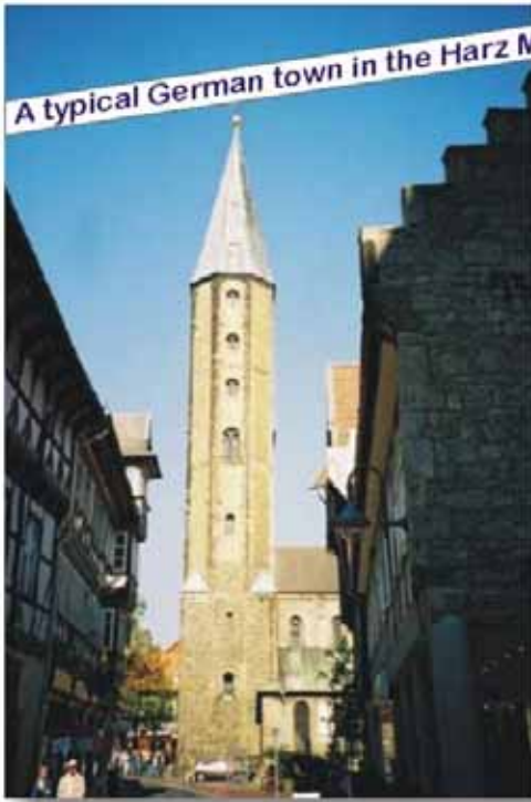
A typical German town in the Harz Mountains