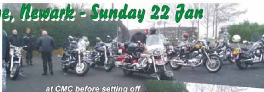
at CMC before setting off

The forecast was 4°C and fog but still 15 bikes gathered at CMC Chesterfield ready for a ride to the Barge at Newark. Some, like Pete and Lee Brown even travelled from Leicestershire to take part. And so a pleasant ride of about 30 miles was had along gently winding roads through the villages to Newark with varying amounts of sun and fog along the way. Road conditions were good barring the odd patch of mud.