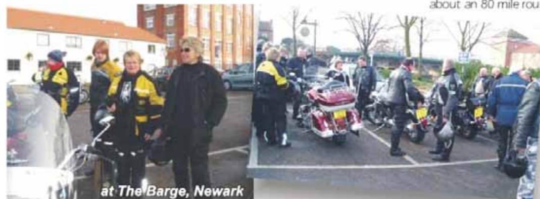
at The Barge, Newark

After about 1 1/2 hours and with the sun now broken through, some chose to go directly home but the convoy of now 14 bikes continued on its way up the east side of the Trent, over Dunham Bridge, then to Worksop and back to Chesterfield which made about an 80 mile round trip.