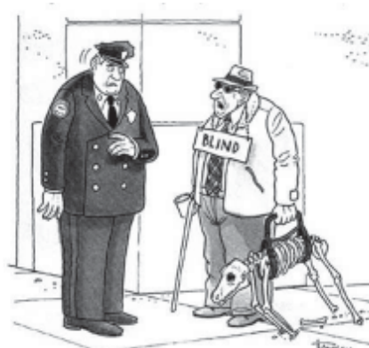
Lasiest dog I ever had...